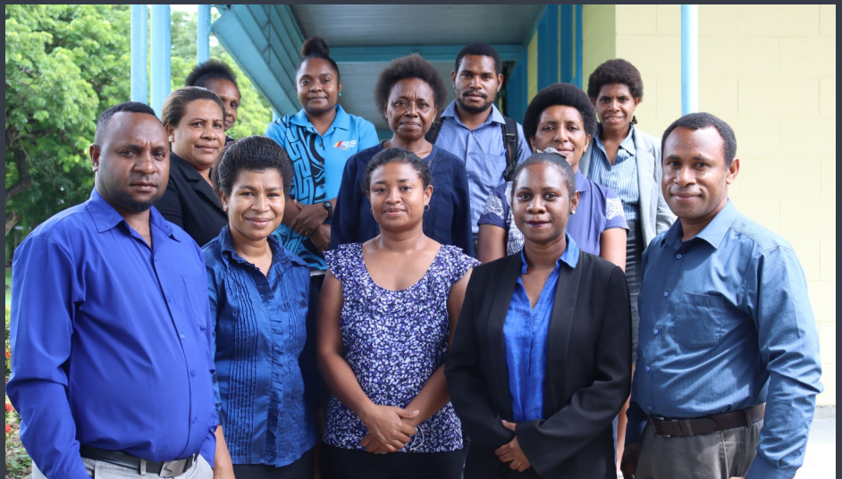
Officers who undertook the Public Service Induction Program at the Pacific Institute of Leadership and Governance (PILAG).