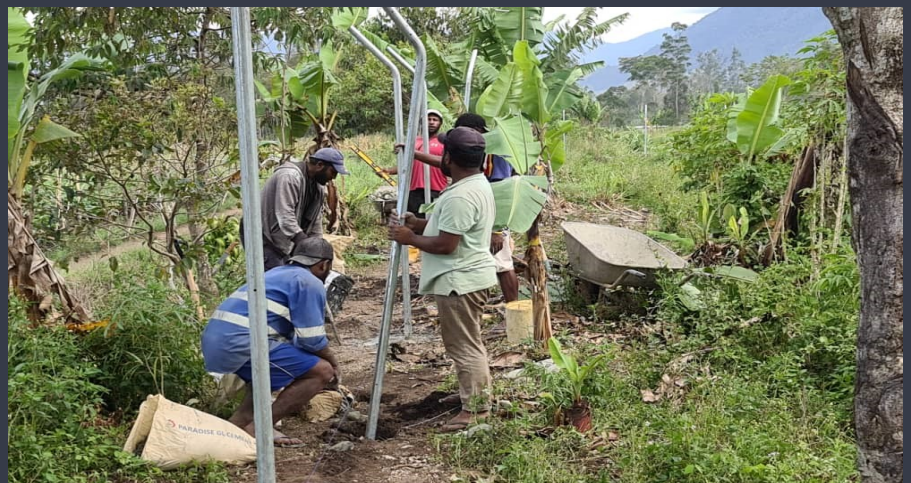
Landowners putting up fences around the land that will be used to build PSC's first regional office in the Highlands Region.

He maintained that the regional office in Mt Hagen will help facilitate all the needs of the highlands provinces; and in future, if further funding is given, PSC will also establish other regional offices in the Momase and New Guinea Islands regions, whilst the PSC office in NCD will cater for the Southern Region.