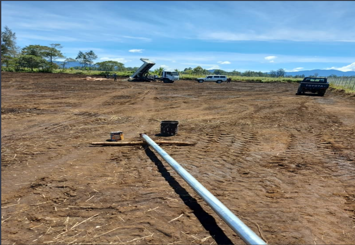
Land has been cleared and construction is now underway for the Public Services Commission's first ever Highlands regional office in Mt Hagen, Western Highlands Province.